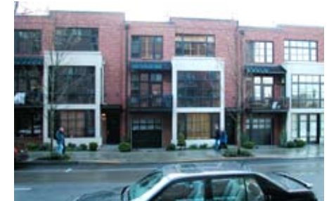
A variety of architectural styles may help capture a wider segment of the housing market.

will represent the best possible future for the City. Policy makers take note, it will require fortitude to insist that development adhere to the goals and guidelines established by the master planning process and recorded in this document. By holding firm, especially in the early years, it will be possible to alter the way development occurs in the City.